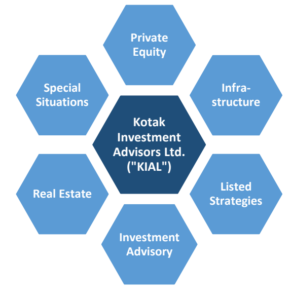
Figure 1-1: KIAL's Business Verticals

Each asset class is managed by independent teams ("Business Verticals") and each Business Vertical (BV) will also, from time to time, raise additional capital ("New Funds") from domestic and / or international investors and make investments in investee companies from such New Funds. Such New Funds may acquire majority or minority equity stakes, invest through mezzanine instruments and / or provide credit to their investee companies.